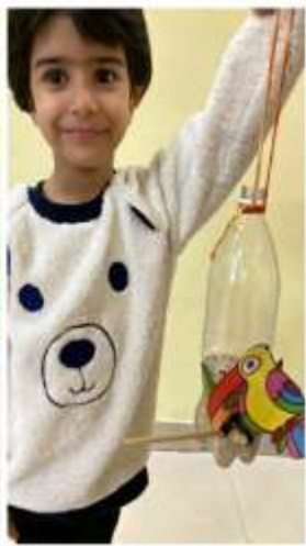
Nursery F Bird Feeder