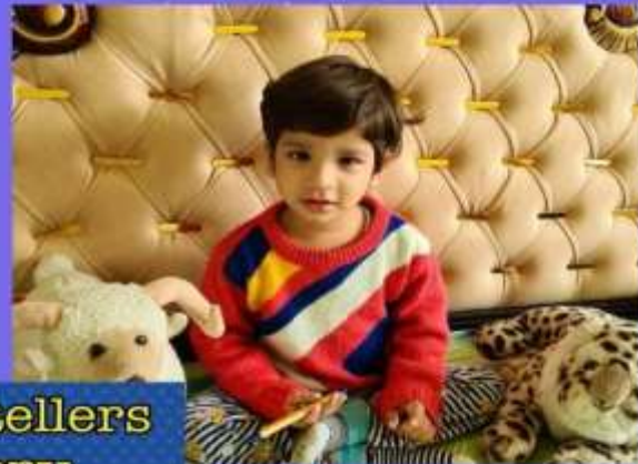
Little Storytellers Pre-nursery